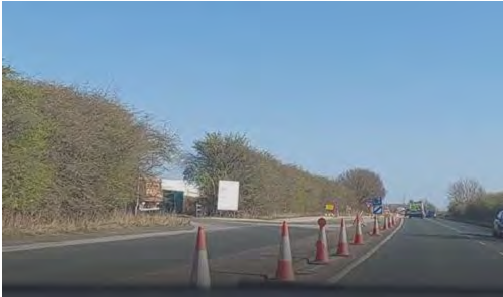
Plate 2: Existing Dogger Bank Creyke Beck access.