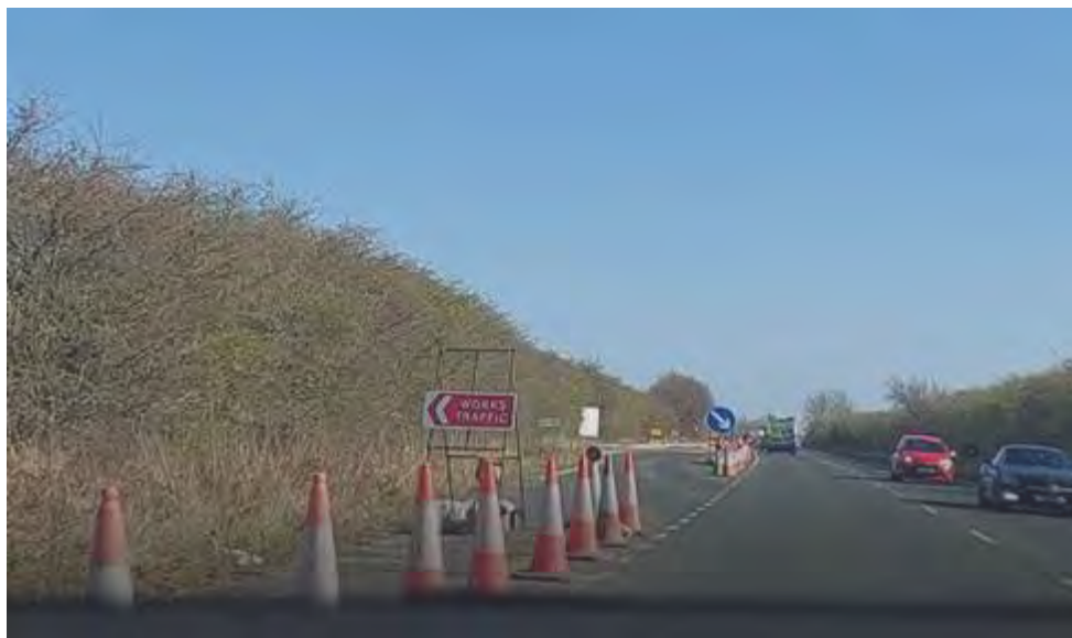
Plate 1: Approach to Existing Dogger Bank Creyke Beck access.